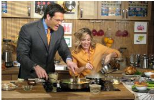
Iron Chef Cat Cora stopped by FOX Kitchen to make a heart healthy Chicken Pot Pie with Puff Pastry! It's a tasty recipe that keeps the flavor, and cuts the fat and cholesterol.